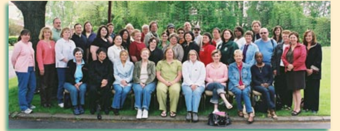
Legal Aid Society staff in 2007.